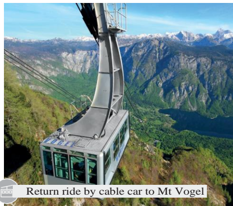
Return ride by cable car to Mt Vogel