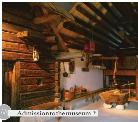
Admission to the museum.*

TOURISM BOHINJ, Stara Fužina 38, SI – 4265 Bohinjsko jezero, t: 04 57 47 590, e: info@bohinj.si INFO CENTER RIBČEV LAZ, Ribčev Laz 48, SI – 4265 Bohinjsko jezero, t: 04 57 46 010, e: info@bohinj-info.com ŽIČNICE VOGEL BOHINJ d.d., Ukanc 6, SI – 4265 Bohinjsko jezero, t: 04 57 29 712, e: marketing.vogel@siol.net www.bohinj.si