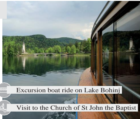
Excursion boat ride on Lake Bohinj