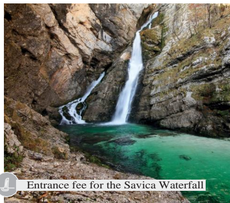
Entrance fee for the Savica Waterfall

Package services (excluding services at restaurants) are free of charge for children to 6 years of age.